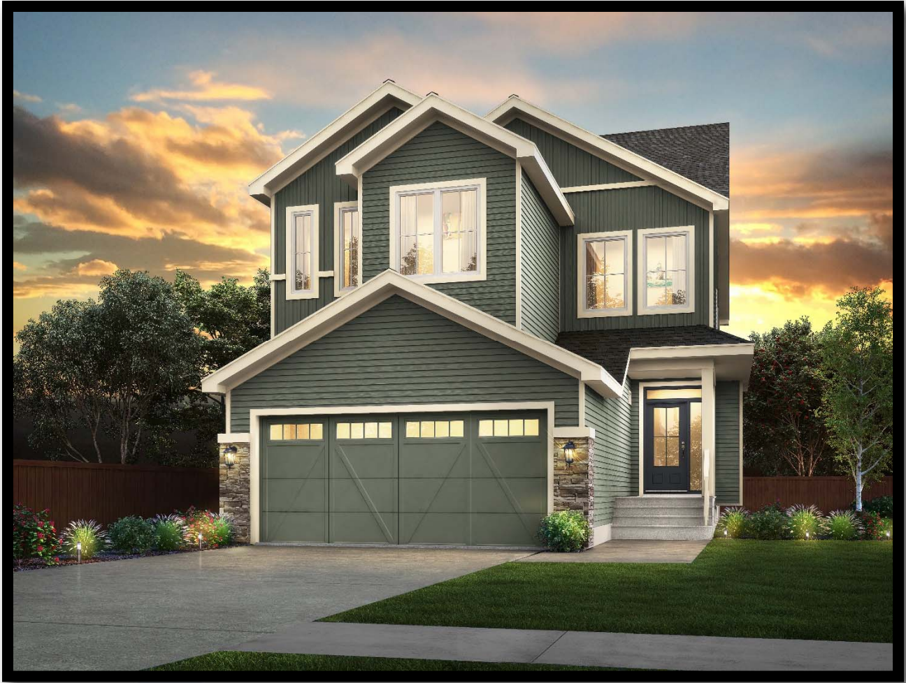
Modern Farmhouse Elevation * ARTIST RENDERING – SUBJECT TO CHANGE *