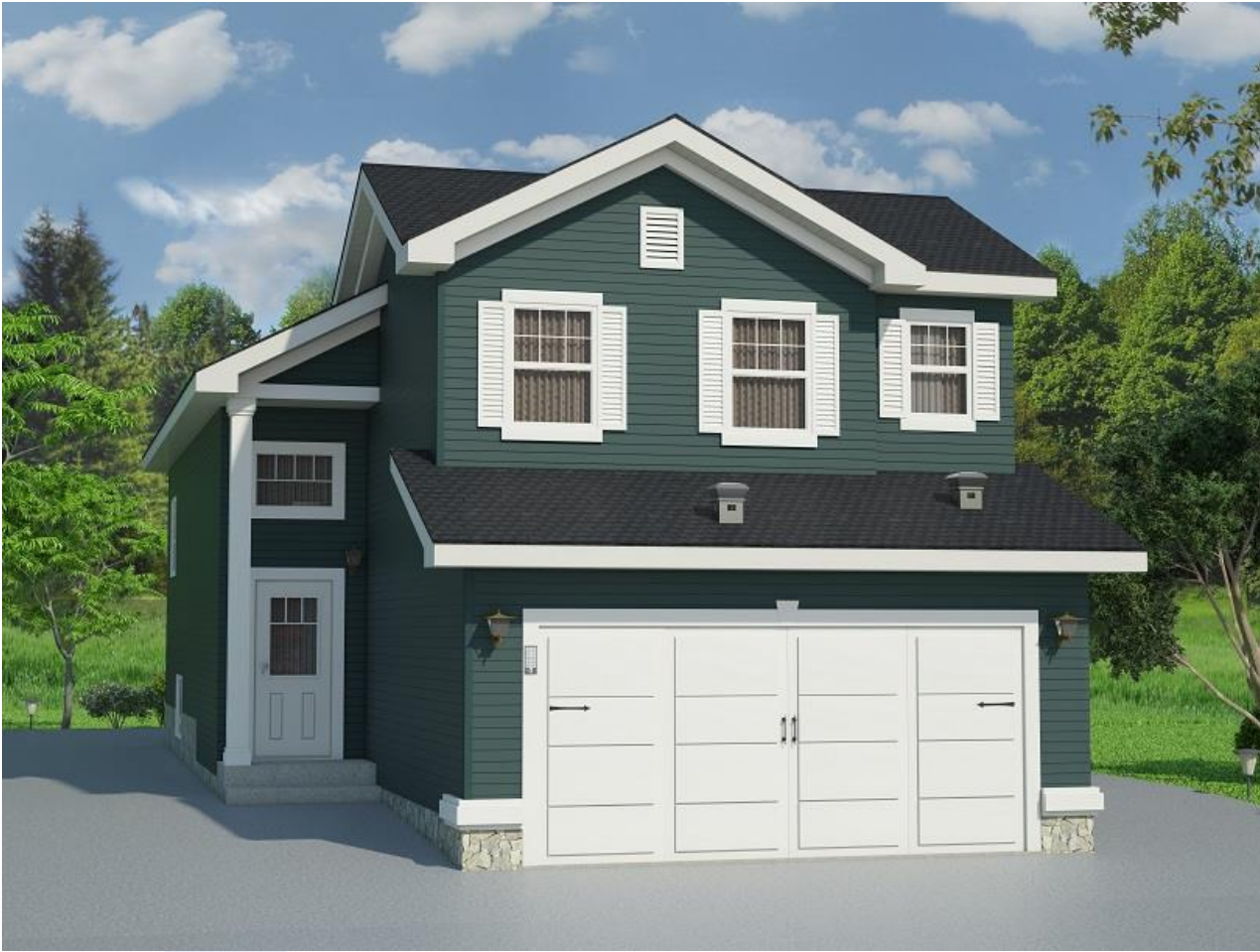
Craftsman Elevation * ARTIST RENDERING – SUBJECT TO CHANGE *