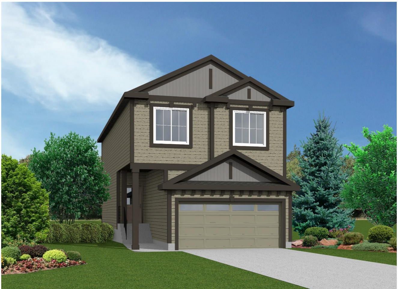
Craftsman Elevation * ARTIST RENDERING – SUBJECT TO CHANGE *