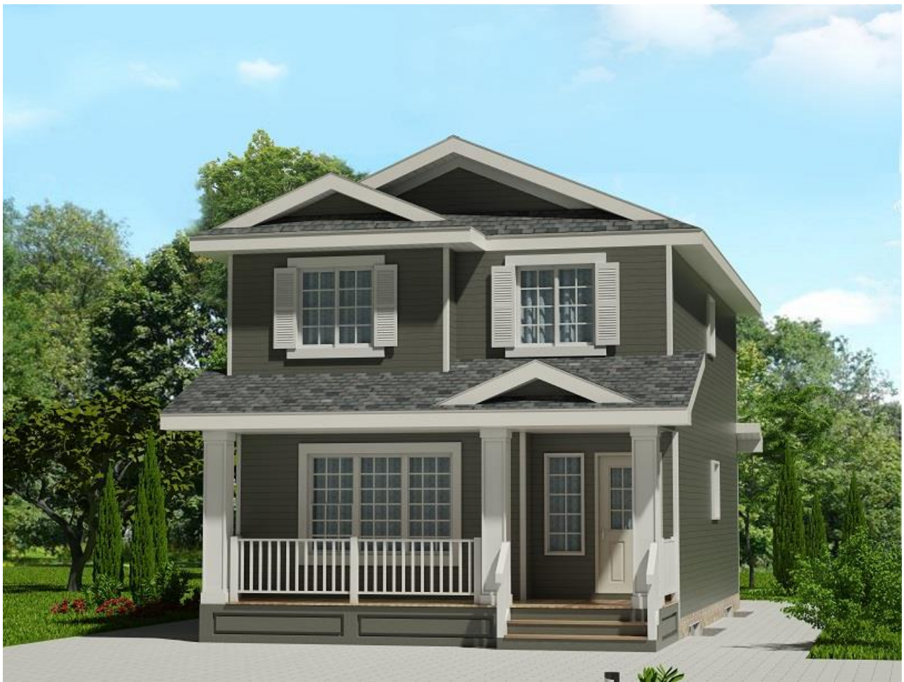
Craftsman Elevation * ARTIST RENDERING – SUBJECT TO CHANGE *