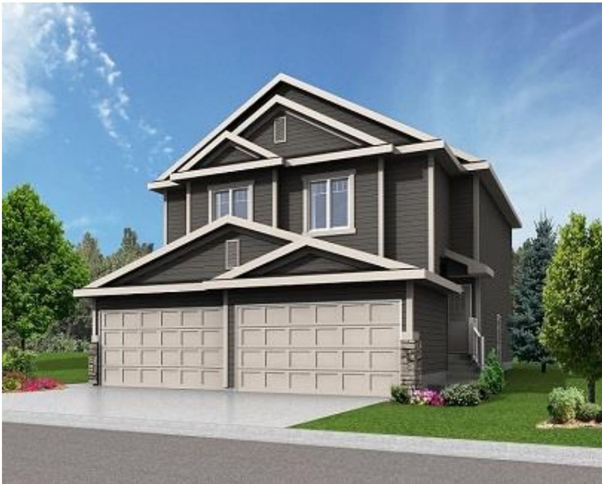
Craftsman Elevation * ARTIST RENDERING – SUBJECT TO CHANGE *